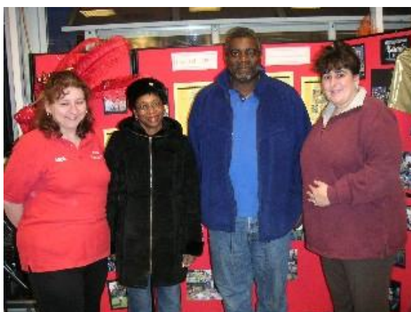
Reading Community Carnival Chairman and Secretary with the Promotions Team from Asda's Tilehurst Branch